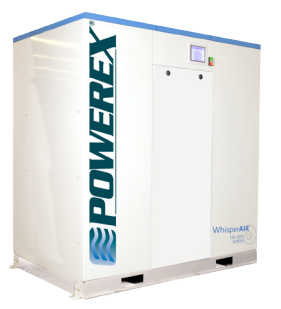
Medical Enclosed Scroll