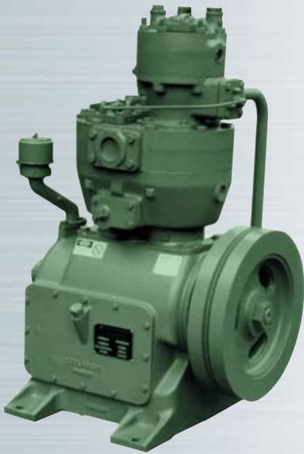
Standard Model LAB Two-Stage Compressor

From design, to selection of materials, machining and construction the L-Series Gardner Denver® water cooled compressors are designed for 24 hours a day, 7 days a week continuous duty operation. Tough cast iron construction and pressurized lubrication provide complete dependability and optimum performance. Two-Stage construction operates at pressures up to 1000 psig. Booster compressors, both single and two-stage, have discharge pressure capability to 2000 psig.