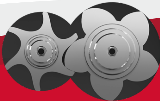
Gardner Denver, 176 mm